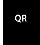
Second level 901 sq. ft.

CAMI proudly includes COMFORT elements in our homes, carefully developed based on the lifestyle you and your family can enjoy. Lasting value, lasting luxury and lasting COMFORT .